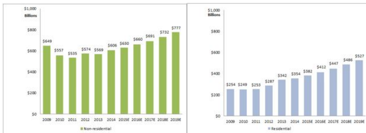
Historical U.S. Total Construction Spend

Schuff consists of three business units spread across diverse steel markets: Schuff Steel Company (steel fabrication and erection), Schuff Steel Management Company (management of smaller projects, leveraging subcontractors) and the Aitken product line ("Aitken") (manufacturing of equipment for the oil & gas industry). For the fiscal year ended December 31, 2015, Schuff Steel's revenues of $470 million account for 92% of Schuff's total revenue. Schuff Steel Management Company's revenues of $26 million account for 5% of Schuff's total revenue. Aitken's revenues of $6 million account for 1% of Schuff's total revenue. Schuff also provides fabricated steel to Canada and other select countries, including Panama, where Schuff owns 49% of Panama-based Schuff Hopsa Engineering, Inc., an engineering design, steel fabrication and erection company, Empresas Hopsa, S.A. Schuff Hopsa Engineering, Inc.'s revenues of $12 million account for 2% of Schuff's total revenue. In 2015, Schuff's single largest customer represented approximately 23% of revenues.